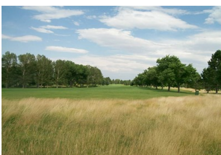
Junior golf is also available for your sons and daughters ages 8 to 17.