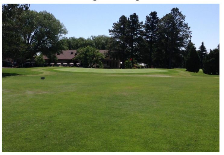
Our professional golf staff provides individual lessons to all members and children of every age and experience level.